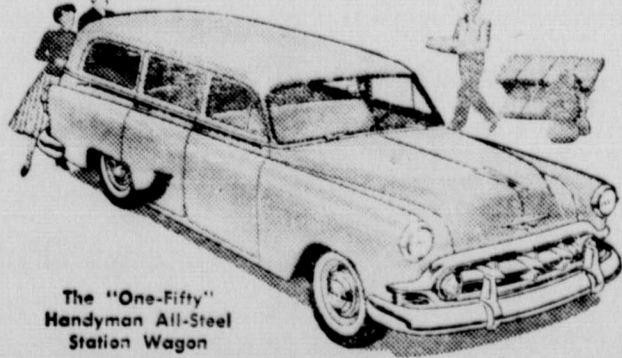
The "One-Fifty" Handyman All-Steel Station Wagon