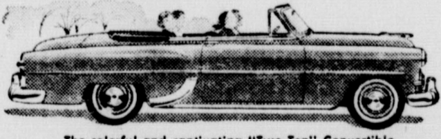
The colorful and captivating "Two-Ten" Convertible

*Optional at extra cost. Combination of Powerglide automatic transmission and 115-h.p. "Blue-Flame" engine available on "Two-Ten" and Bel Air models. Power Steering available on all models.