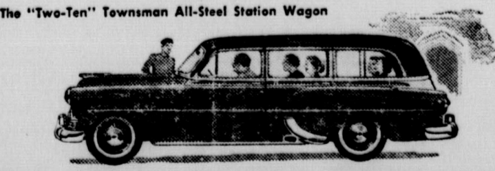
The "Two-Ten" Townsman All-Steel Station Wagon