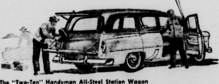
The "Two-Ten" Handyman All-Steel Station Wagon