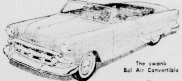
The swank Bel Air Convertible

Seven entirely new Chevrolet sport models ...widest, smartest choice in the low-price field!