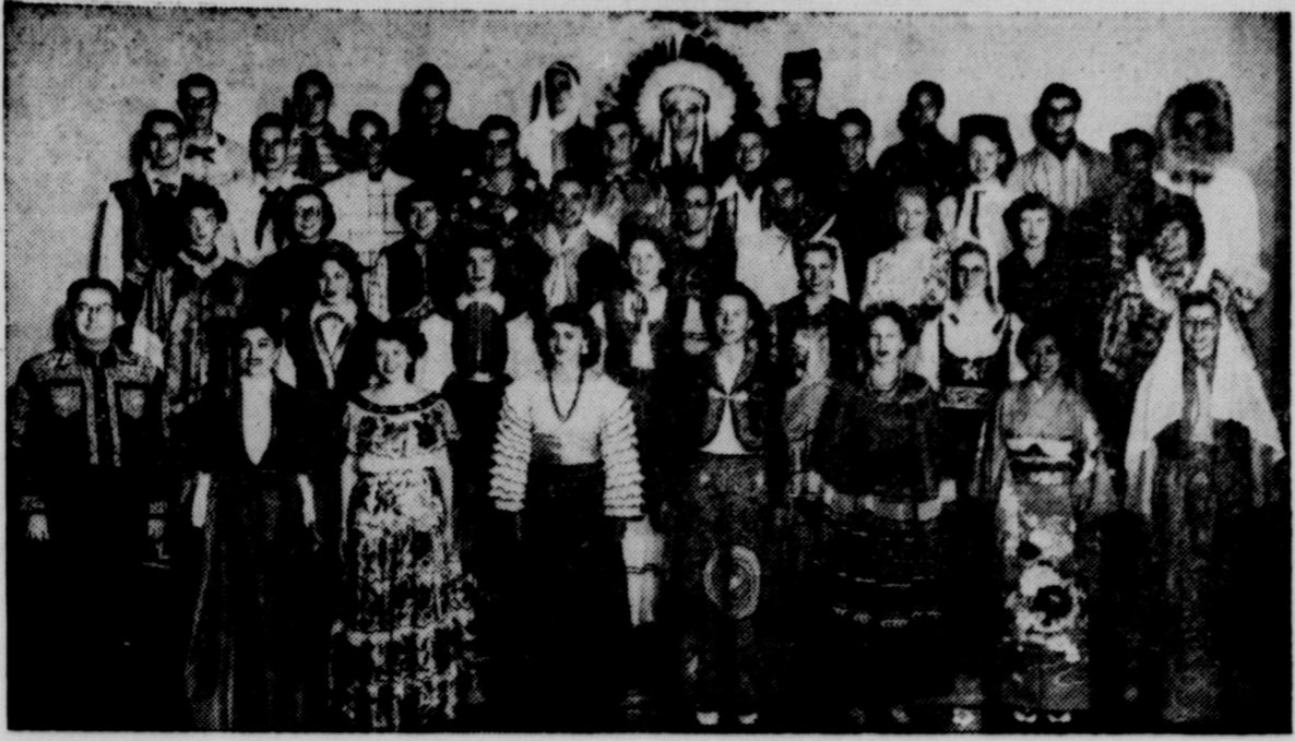
The Colorful and much traveled Wayland College International Cappella Choir, Plainview, will be presented on Friday