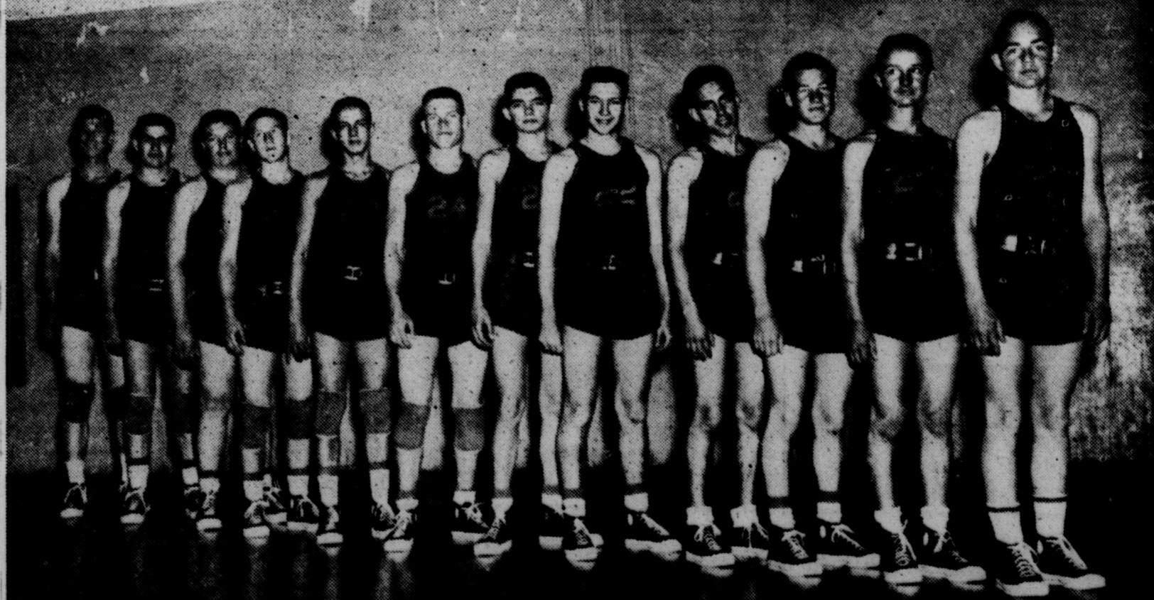
bers of the 1953-54 Crowell High School basketball squad. From left to right, they are: