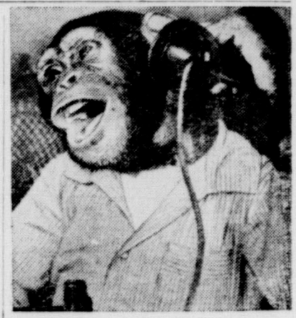
"Hollywood is hot stuff, eh, Francis? You should see the babe I met on the Tarzan set!" "Bedtime for Bonzo" at Rialto Sunday and Monday.