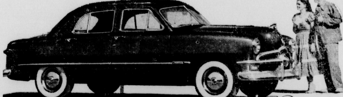
White sidewall tires and wheel trim rings optional at extra cost.