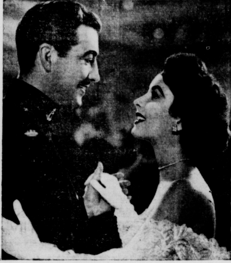
"Conspirator," new MGM drama opening at the Rialto Theatre this week, offers a new high in romantic teams in the persons of Robert Taylor and lovely Elizabeth Taylor, co-starred for the first time. Elizabeth reaches the peak of her meteoric career in her first mature emotional role as Robert Taylor's young wife.