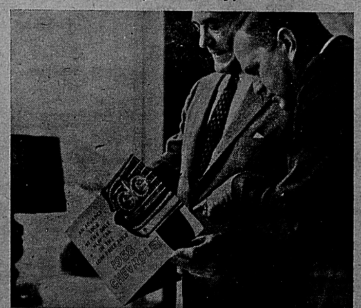
You can place your order now at Your Local Authorized Chevrolet Dealer's