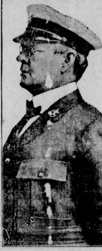
Chief Sea Scout of the Sea Scouts of the Boy Scouts of America.

The plan is a thoroughly working one and its promotion attracts a great