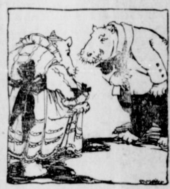
It is a Pleasure.

"Do I merely think that?" asked rs. Hippo, "Or am I correct? Is Mrs. Hippo. t not true that you like your meals?" "Quite true," said Mr. Hippo, "quite true. I like my meals humensely.