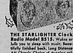
THE STARLIGHTER Clock Radio Model B515. Wakes or lulls you to sleep with music. Beautifully finished back. Long Distance AM Chassis. Choice of stunning colors. AC only. 5 1/4" H, 11 1/4" W, 6" D.

Harold's Specialty Shop 304 Market St. Ph. 4-1220 Baird, Texas