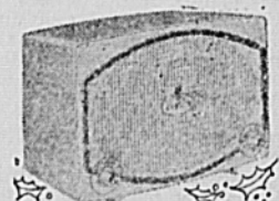
THE TREADOR, Model B513. 6" x 9" speaker. Beautifully finished back. Long Distance AM chassis. In choice of beautiful colors. 7 1/4" H, 10 1/4" W, 6 1/4" D. AC/DC.