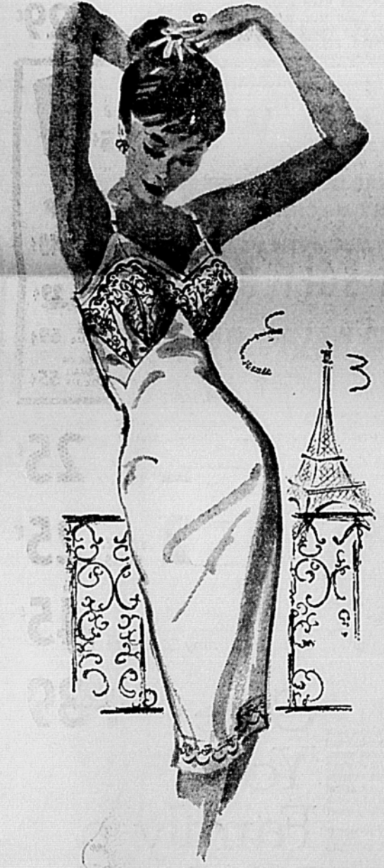
"CHERIE" Nylon Tricot Slip by Munsingwear.

Gaily Parisian in mood... this Munsingwear Slip of carefree nylon tricot. Bodice and hem exquisitely embroidered in the French manner. In white, pink, blue or black. Also dramatic black embroidery on pink or blue; toast on gold champagne. Sizes 32 to 40, Regular and Tall; 32 to 38, Short. $5.95