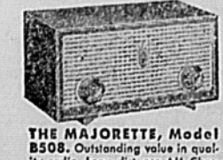
THE MAJORETTE, Model B508. Outstanding value in quality radio. Long distance AM Chassis. Wavemagnet Antenna. Choice of beautiful colors. 5 1/4" H, 9 1/4" W, 4 1/4" D. AC/DC.