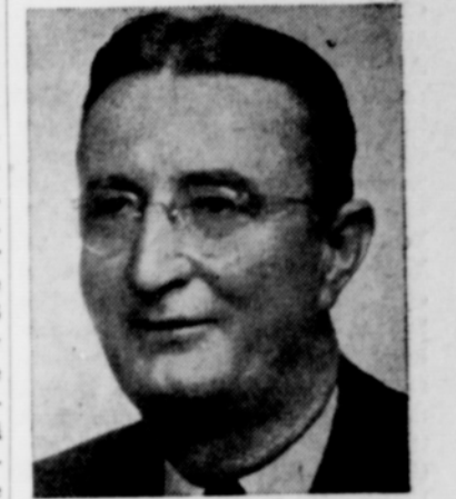
To the Voters of the 24th Senatorial District:

Early in January of this year I announced my candidacy for re-election to a second full term in the Texas Senate. I now want to take this opportunity to solicit the votes and influence of the citizens of this district in the July primary.