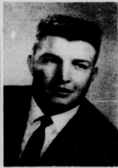
COACH GRANT TEAFF