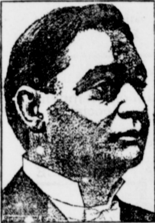
SENATOR JOSEPH W. BAILEY OF TEXAS.

"I have not intended to discuss any phase of this legislation until a suitable time to discuss every phase of it," he said in introducing his speech. He said that the suggestion made by him ten days ago in respect to the powers of congress to limit inferior federal courts in the matter of issuing injunctions had been discussed so widely and assailed so fiercely that he felt required to make a further statement. Complaint was made by the various arguments of the newspaper comments regarding his suggestions, which he said "seemed to be furthering a deliberate effort to make it appear he had advanced an unconstitutional proposition, and so obviously