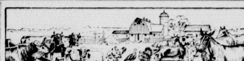
Weatherboarding Against Winter