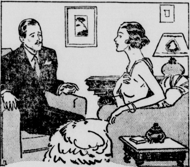
"It's all over and I want you to let me alone."

... "A new Swedish method has it possible to extract about sixty pounds of sugar from 100 pounds of wood."