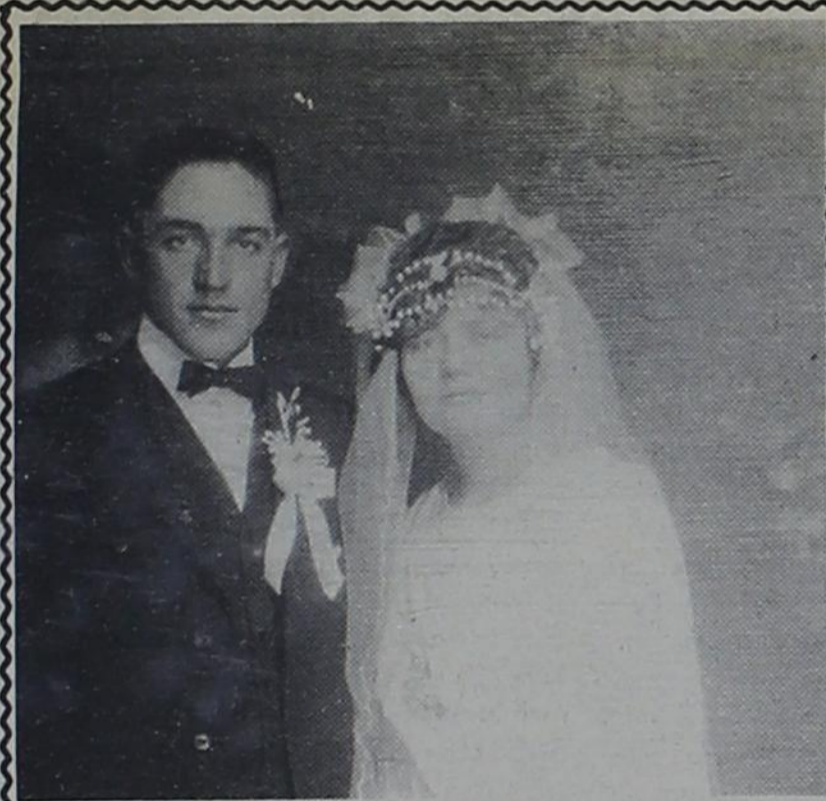
Happy 60th Anniversary Mom and Dad