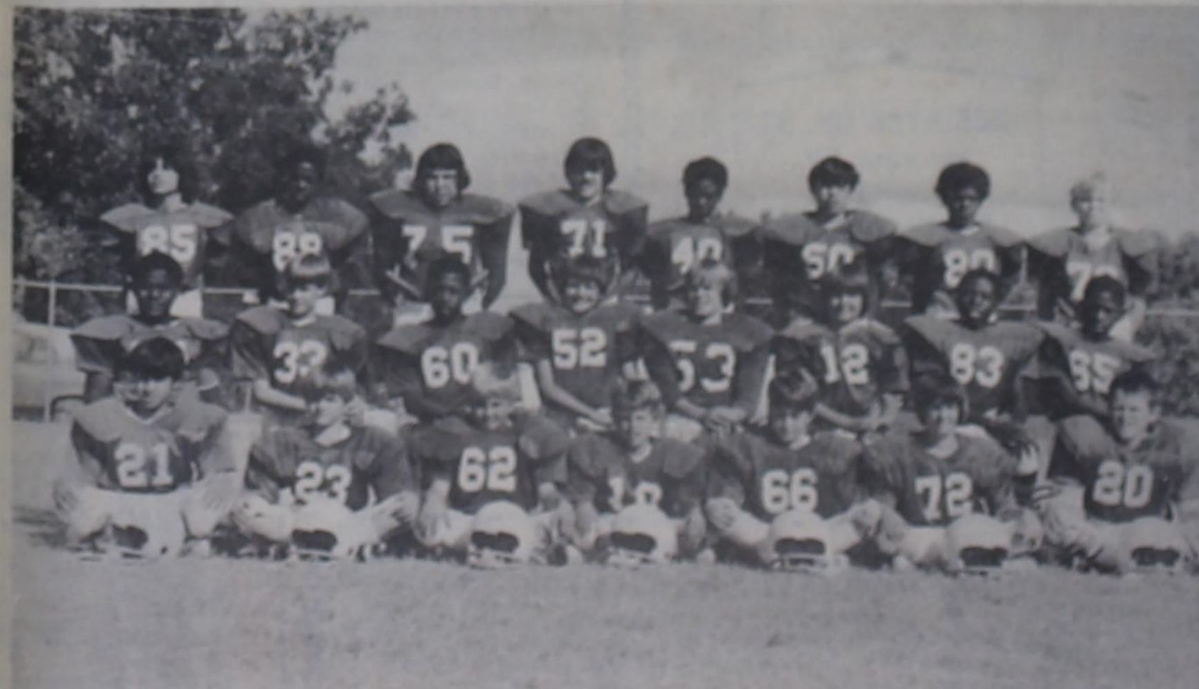
1979 Sixth and Seven Grade Braves