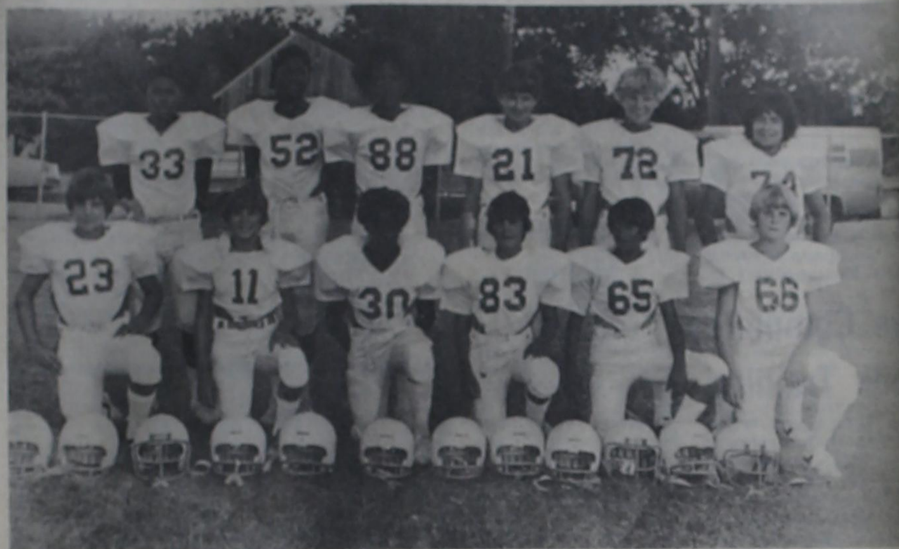
Twelve Fighting Braves The Future Mogul Varsity