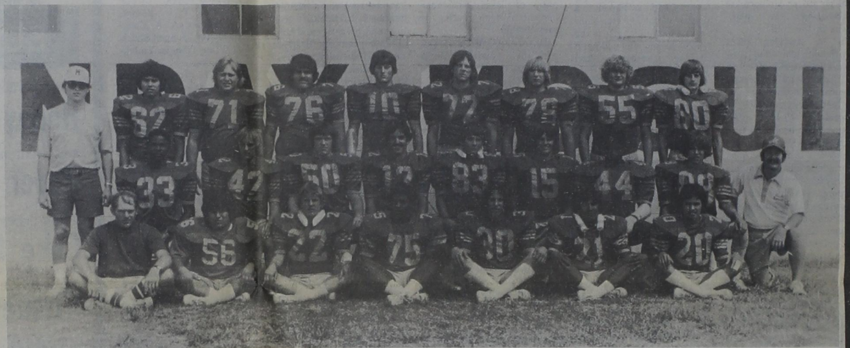
1979 Munday Mogul Varsity Football Team