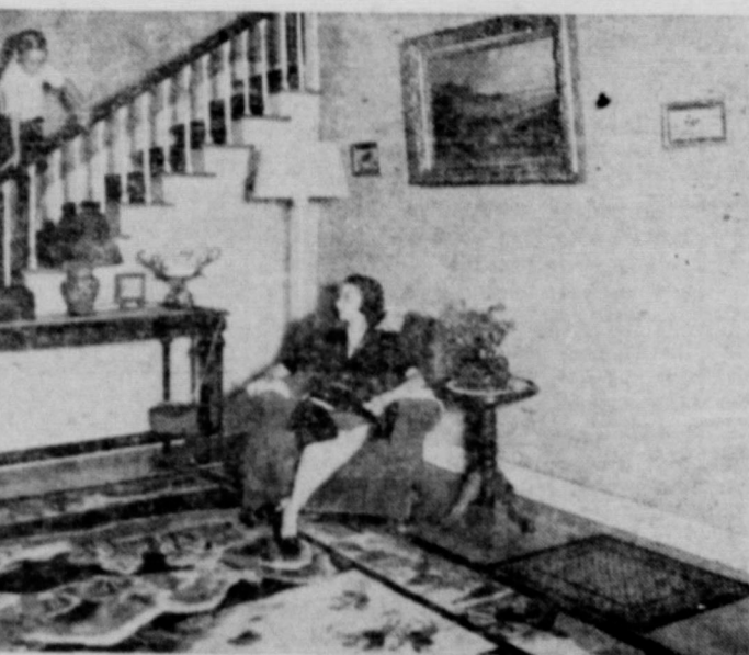
This sample photo shows a modern gas floor furnace installed in the living room of one of our customers.

A prize of $10 will be awarded EACH of the TEN BEST PHOTOS submitted each week. At the close of the TEN WEEK PHOTO CONTEST four additional grand prizes of $100, $75, $50 and $25 will be awarded the four best photos submitted.