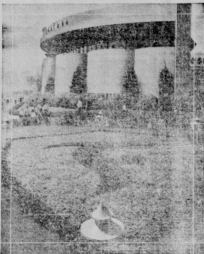
The gardens of the Firestone Factory and Exhibition Building at "A Century of Progress" of 1934 are as beautiful as the factory is efficient. In the triangle north of the building, where two main thoroughfares meet, is the Firestone "Mark of Quality." The border and the letter "F" are made up of 1,250 orange lanterns, and the field is made up of 2,675 blue ageratum—a total of 3,925 plants.

3865 Flowers Make Emblem in Gardens Of World's Fair Tire Factory