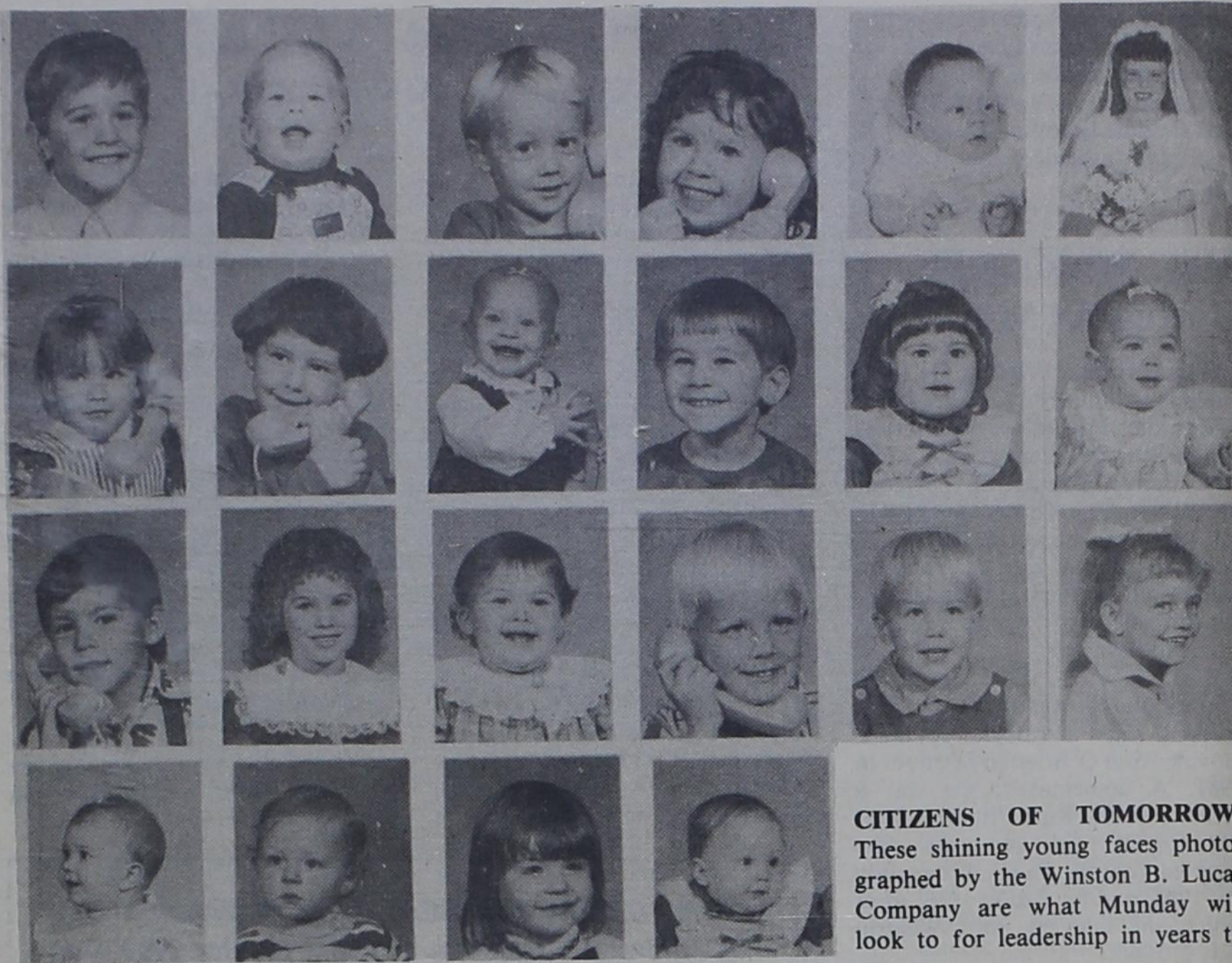
CITIZENS OF TOMORROW: These shining young faces photographed by the Winston B. Lucas Company are what Munday will look to for leadership in years to