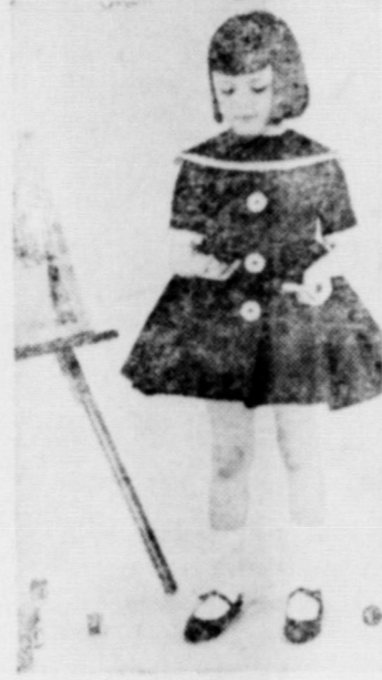
SCHOOL BELLE —No need to worry about paint spills—your little girl can be feminine to her heart's content in this cotton charmer. It's a Kate Greenaway creation of self-ironing Belfast cotton that can be washed any way at all and never needs ironing.