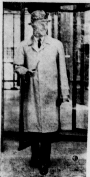
WELL-GROOMED —Whatever the weather, here's a coat that's ready for it. Fashioned in a handsome woven club check of water-repellent cotton, this coat by Alligator has raglan sleeves, slash pockets, and a fly front. The cotton lining is a striking plaid.