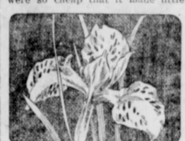
Spanish Iris With Its Long Stem Makes Ideal Cut Flower Material.

Another bulbous iris even more pretentious in its beauty than the slender, graceful spanish iris is the english iris, resembling a small japanese iris in form and coloring. It needs moist, heavy soil and the spanish and english are seldom happy in the same garden unless special conditions in heavy soil are created for the spanish type. Both bloom later than the tall, bearded The spanish with its very thin foliage has not so much dec-orative value in the garden as other irises but its long stem makes it ideal cut flower material and unlike its kin .which grow from rhizomes, rather than bulbs, the flower lasts well when cut. These of the plant quarantine board and cannot be imported. Formerly they were so cheap that it made little