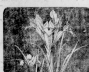
English Iris Is Smaller Than Spanish and its Coloring is Beautiful.

It is a useful little bulb to scat-ter all over the garden, dibbling in