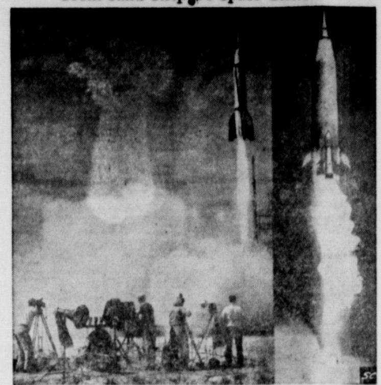
Two missile photos, ten years apart, span history of Cape Canaveral, Fla. On July 24, 1950, G-E managed Bumper 8 fired from relatively crude launching pad (actual photo, left). Ten years later missile nose cone (right) flies record 9,000 miles.

Cape Canaveral: 10 Years Of Progress From Sand Strip To Space Center