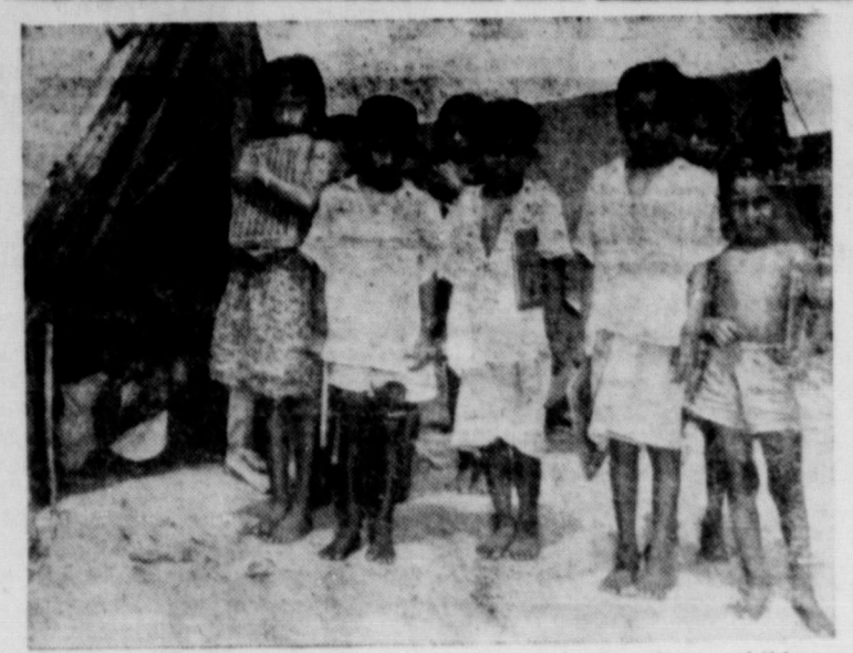
Learning three R's the hard way are these refugee children They and their parents, Hindu expatriates from Moslem Pakistan, live in canvas tents. Milk and an occasional warm meal, supplied by the National Christian Council of India with supplies sent by CROP and Church World Service, are an important supplement to their meager diet.