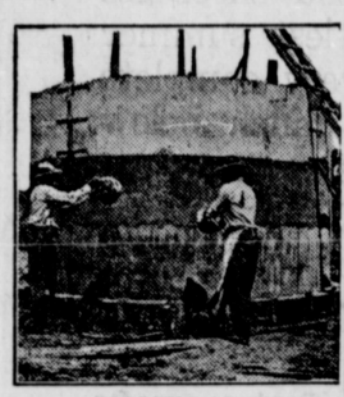
Concrete Silo in Course of Construc

(Prepared by the United States Depart-ment of Agriculture.) By making as much silage as can be sed stockmen will do much to conserve the feed supply. At least 37 per cent of the digestible material of the corn plant is left in the stover when the ears only are used. When corn is ensiled this 37 per cent goes into the silo with the 63 per cent in the ear. The importance of this saving will be more apparent when given a money With a yield of 50 bushels at acre, the value of grain is $75, at $1.50 a bushel. Since the stover contains