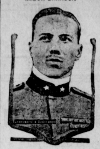
ace, who was recently decorated with the gold military medal