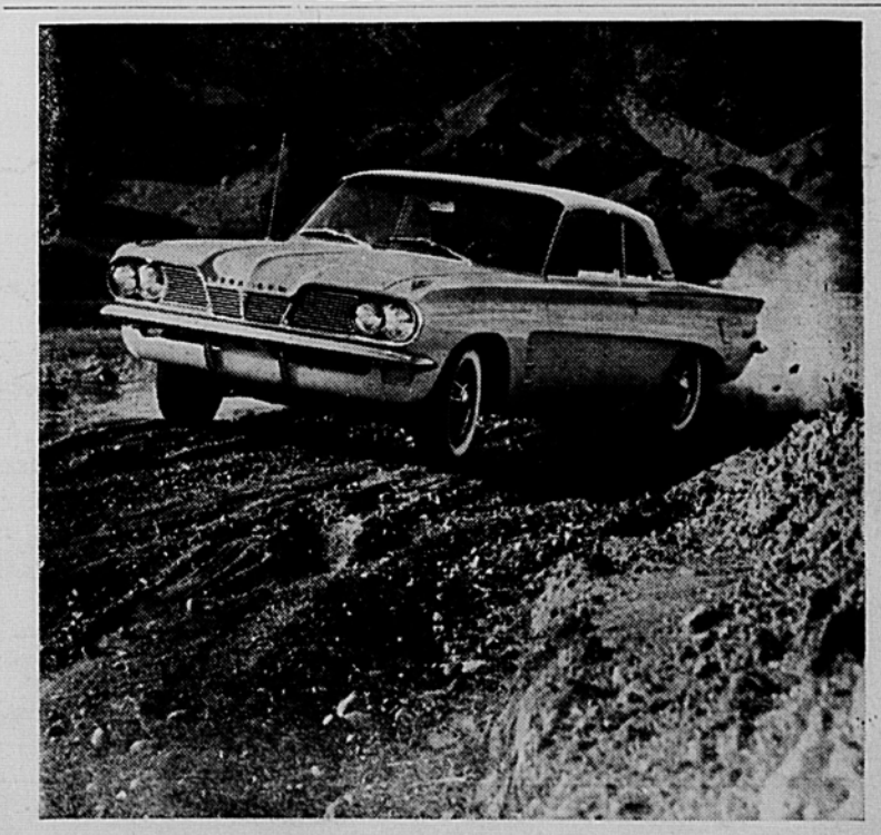
The 4 that goes around acting like a V-8...Tempest!

Used to be that people swore by V-8's and V-8's alone. And then along came Tempest's spunky 4 to steal their thunder. The hottest version' of this 4 (166 hp) puts out more horsepower than any other production 4 in the world. More torque, too. And every version, standard 110 hp on up, is smooth and silent and effortless. About the only thing Tempest doesn't share with the big boys is its appetite for gasoline and spare parts. Try a drive in a Tempest 4 soon, hear? You might as well save while you're swinging! Pontiac Tempest