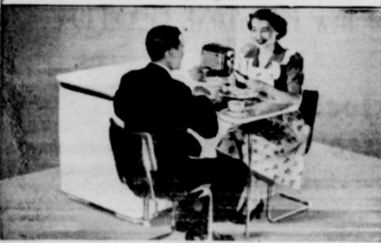
Fold-down law attachment makes handy breakfast table—just one of the many distinctive features. Food capacity 6 cubic feet. Acid-resisting porcelain top serves as kitchen table. Come in and see these and other unusual advantages.