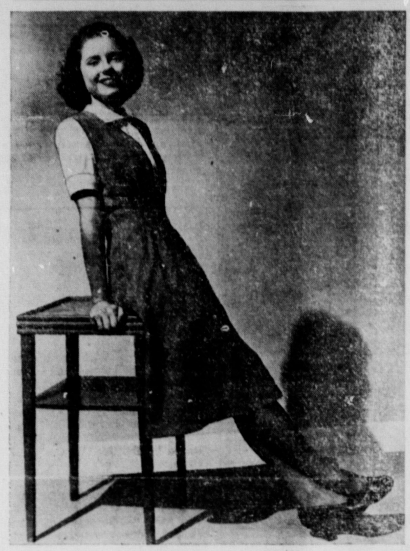
This beautifully tailored jumper is one of the basic dresses which should be included in every wardrobe. It can be worn with hand-knit sweaters, baby-neck blouses or tailored shirts. Endless color combinations can be achieved by making blouses in various shades. The jumper was made from a dress worn out under the arms.

released for civilians...50,000,000 Board. pounds of lard have been released