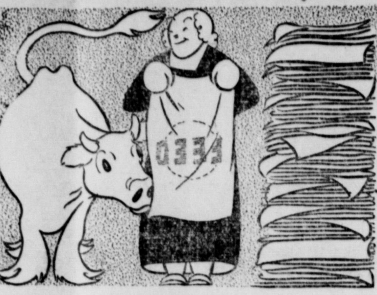
SAVE burlap and cotton bags. They're scarce. Patch them, keep them dry, use them as many times as you can.