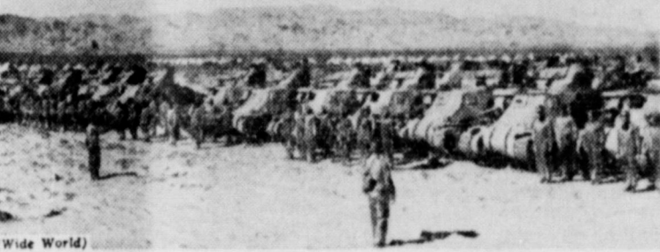
DESERT TRAINING-U. S. soldiers are learning the ins and outs of desert warfare at the huge new training base near here at Indio, Calif. Here they are—men and tanks—lined up during recent