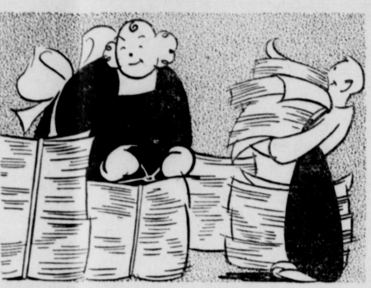
SELL your old newspapers and magazines. Also, old rags and rubber articles. The Salvage for Victory program needs them.