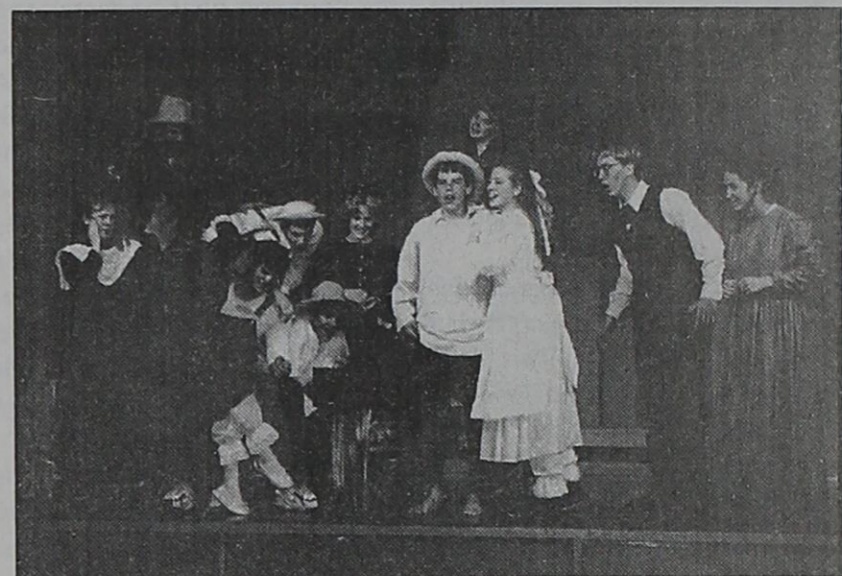
"TOM SAWYER" will live again on the stage at UIL Regional Competition in Levelland on Thursday, April 22. The one-act-play, presented by the Munday High School Theatre Arts Department, features a cast of 15 and a great technical crew.

At the Regional level the Munday Theatre Arts Department will compete against young actors from Wink, Rankin, Hartley, Channing, and Whiteface. ***