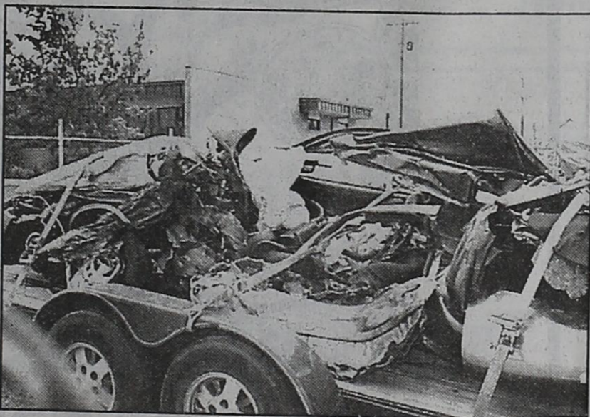
1999 CHEVY CAVALIER. Two young United States Air Force personnel died in this vehicle when it collided with a pick-up truck on Highway 277 Saturday.