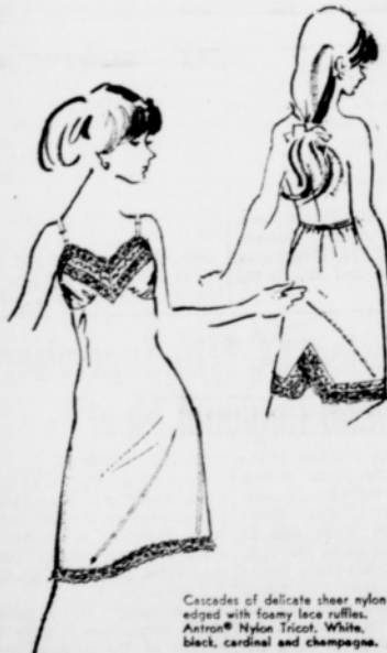
Cascades of delicate sheer nylon edged with foamy lace ruffles. Antracite Nylon Ticot. White, black, cardinal and champagne.

SLIP: Average 32-42; Short 32-38 $4.00 PETTICOAT: S-M-L; Short XS-S-M $3.00 Slip and petticoat also available in tall and extra sizes.