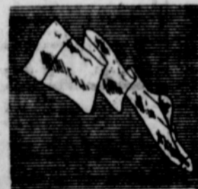
HOSIERY Mojud—Hosiery in the late fall colors

Dresses in WOOL GORGETTE and NOVELTY CREPE Featuring the high neckline, wide shoulders, a form-fitting hip line and remember— at least one Wool Frock for Early Fall.