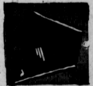
PURSES in brown, navy blue and black