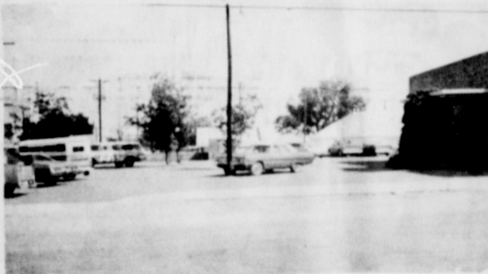
MAJOR IMPROVEMENT IN THE DOWNTOWN AREA is the newly-finished parking lot adjacent to the Citizens State Bank. The bank had the adjoining lot hot-topped last week to widen the parking facilities. The project, which adds much to the beauty of the bank building, was done by Lipham Construction Company of Aspermont.