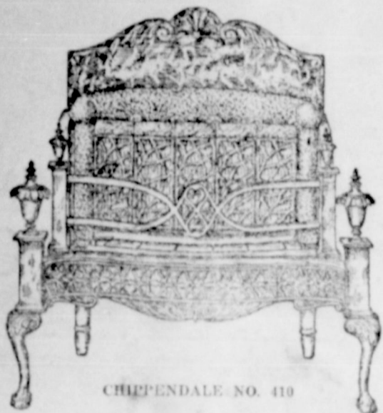
CHEPPEDALE NO. 419