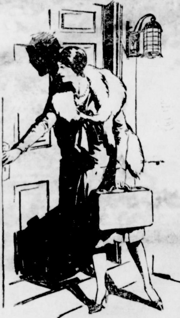
"I'll surprise them," she told herself.