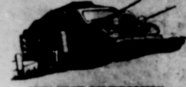
NEW HIGH-COMPRESSION VALVE-IN-HEAD ENGINE with increased horsepower, increased torque, greater economy in gas and oil