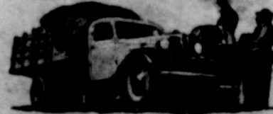
FULL-FLOATING REAR AXLE with barrel type wheel bearings exclusive to Chevrolet