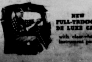
NEW FULL-TRIMMED DE LUXE CAB with clear-vision instrument panel