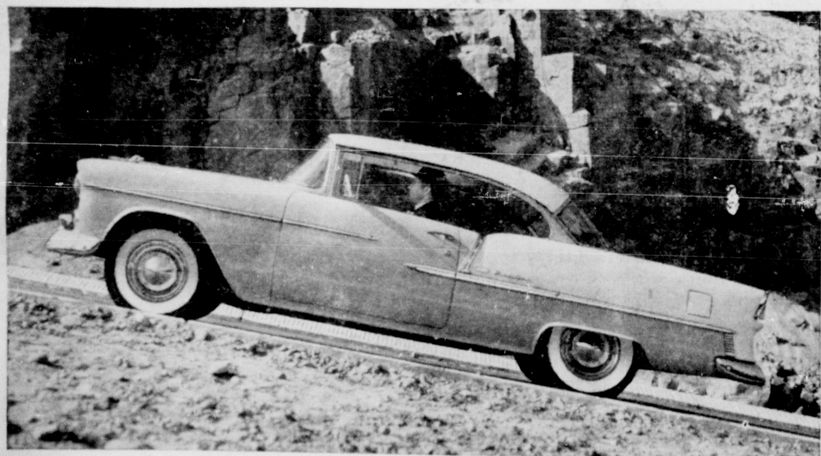
Great Features back up Chevrolet Performance: Anti-Dive Braking-Ball-Race Steering-Outrigger Rear Springs-Body by Fisher-12-Volt Electrical System-Nine Engine-Drive Choices.

A lightning-quick power punch that makes your driving safer! That's one of the reasons for Chevrolet's winning stock car record-but it's not the only one. Not by a long shot!