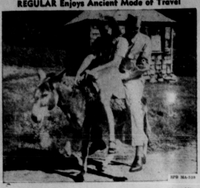
"A for cry from the 'Sidewalks of New York,' says this soldier, as he and his pretty companion make the most of slow travel accommoditions in Antigua, Leeward Islands.