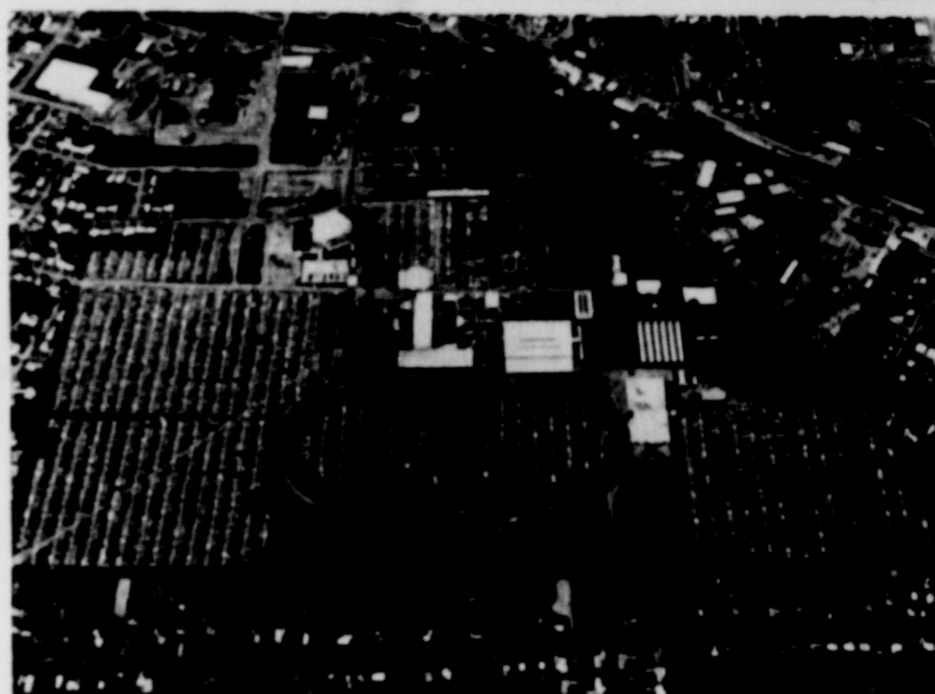
14th INTERNATIONAL RALLY (1971) of the Wally Byam Caravan Club produced this mass formation as 2,869 families parked their Airstream travel trailers at Salem, Ore.