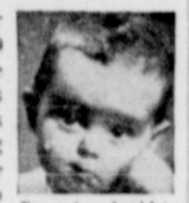
For a free booklet, write Dexter Diaper Factory, Dept. N, Houston 2, Tex.

New type diaper shaped like a B-29 to make one size fit all age babies without folding is a money saving idea. Just one size to buy. So easy to wash and dry. Ask for genuine "Dexter Diapers" at Lowrey Dry Goods in Knox City.