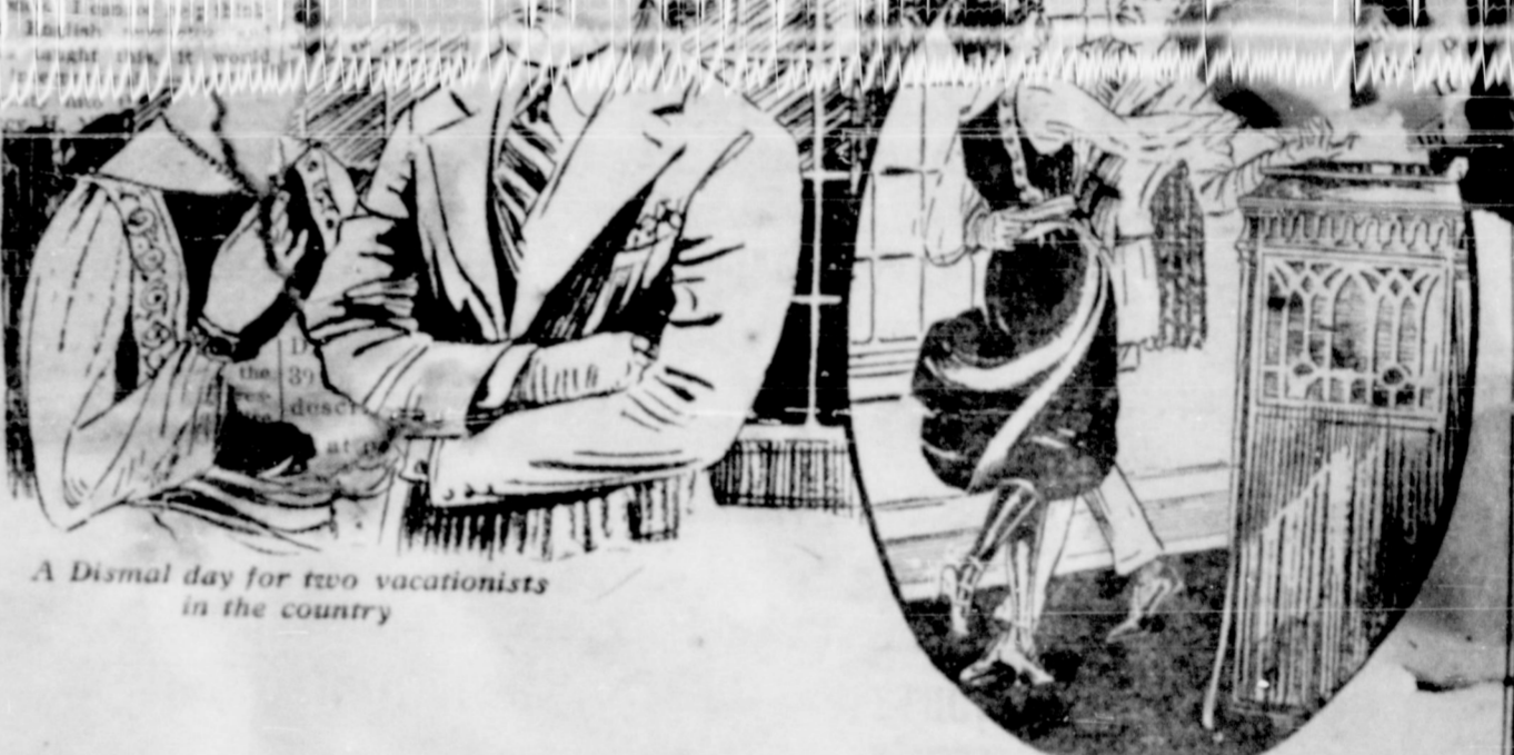
A Dismal day for two vacationists in the country