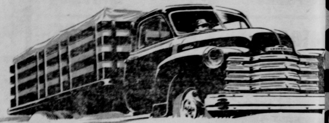
(Continuation of standard equipment and trim illustrated to emphasize on versatility of material.)

WHERE QUALITY, ECONOMY AND COURTESY MEET