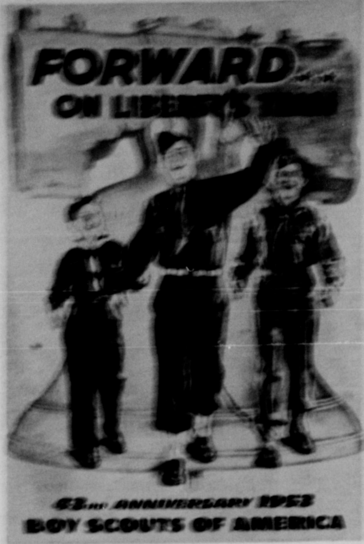
Official Boy Scout Week Poster

Boy Scout Week, Feb. 7-13, 1955, marking the 63rd anniversary of the Boy Scouts of America, will be observed throughout the nation by more than 2,200,000 boys and adult leaders. Since 1919, more than 25,000,000 boys and men have been members.