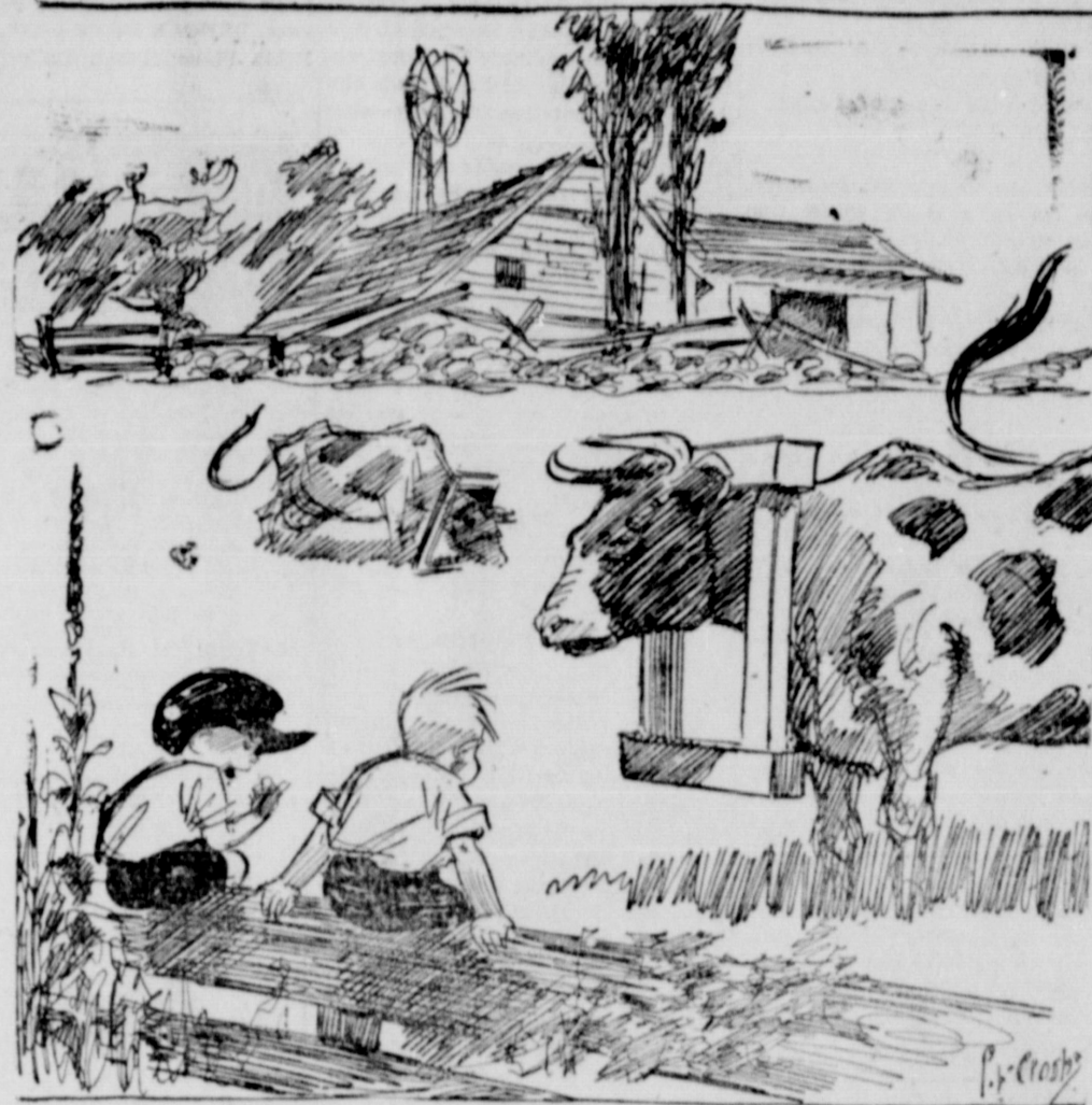
"The Man what started to build this cow's house oughter o' finished it."