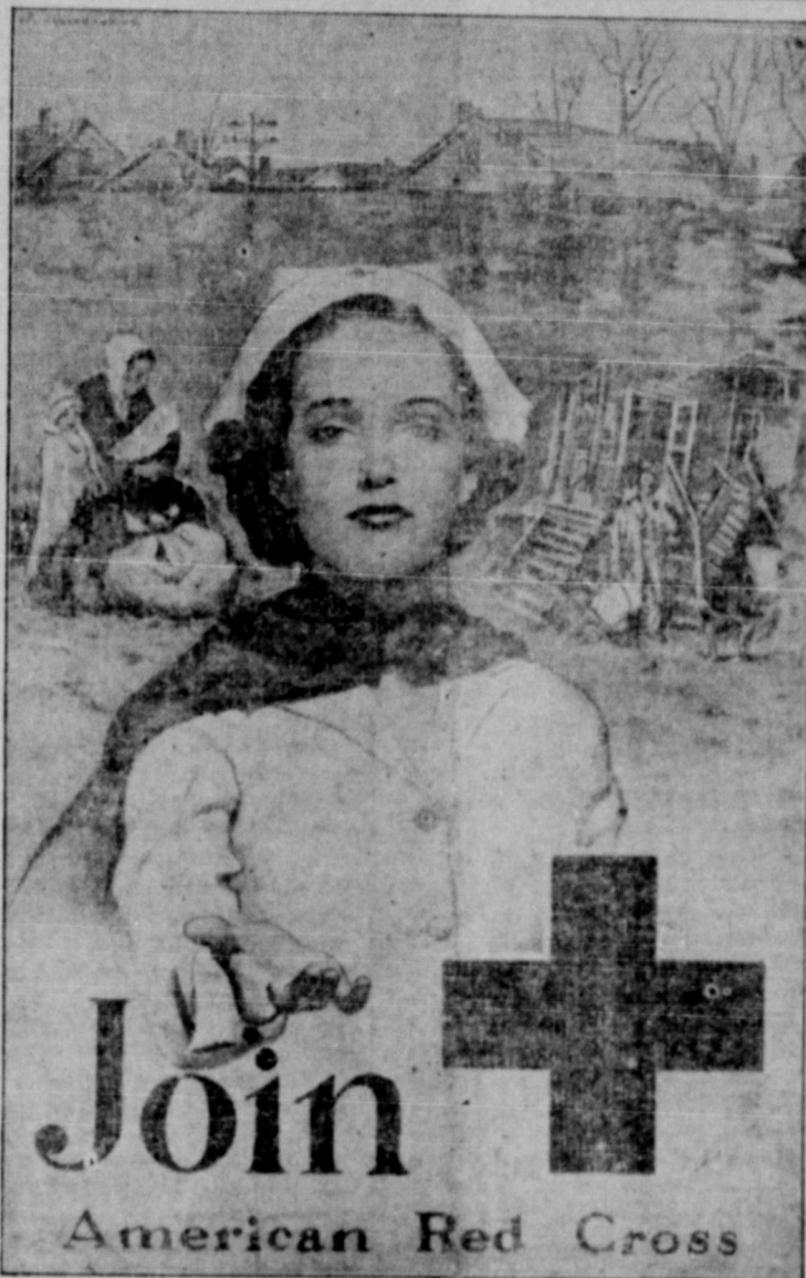
American Red Cross Roll Call Poster for 1939.