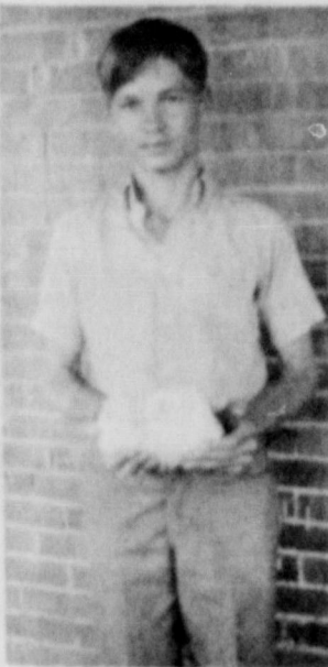
Discovers Elephant Tooth

The defensive unit, consisting of a number of Bulldogs played well, but not without mistakes. Mistakes on offense were obvious at times and the aim of the Bulldogs must be to eliminate mistakes and establish consistent hustle, spirit and aggressiveness as they meet Paint Creek Nov. 12 there at 7 p.m.