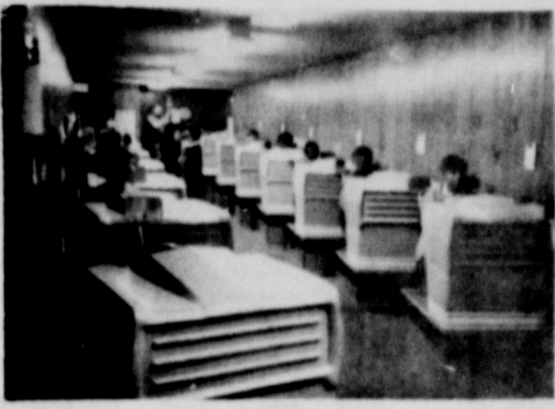
INTERIOR VIEW OF SIMULATOR -- Now in use in the 12-county area served by Region IX, the unit is housed in a trailer for mobility and is situated on the lot of the form- er Ford building.