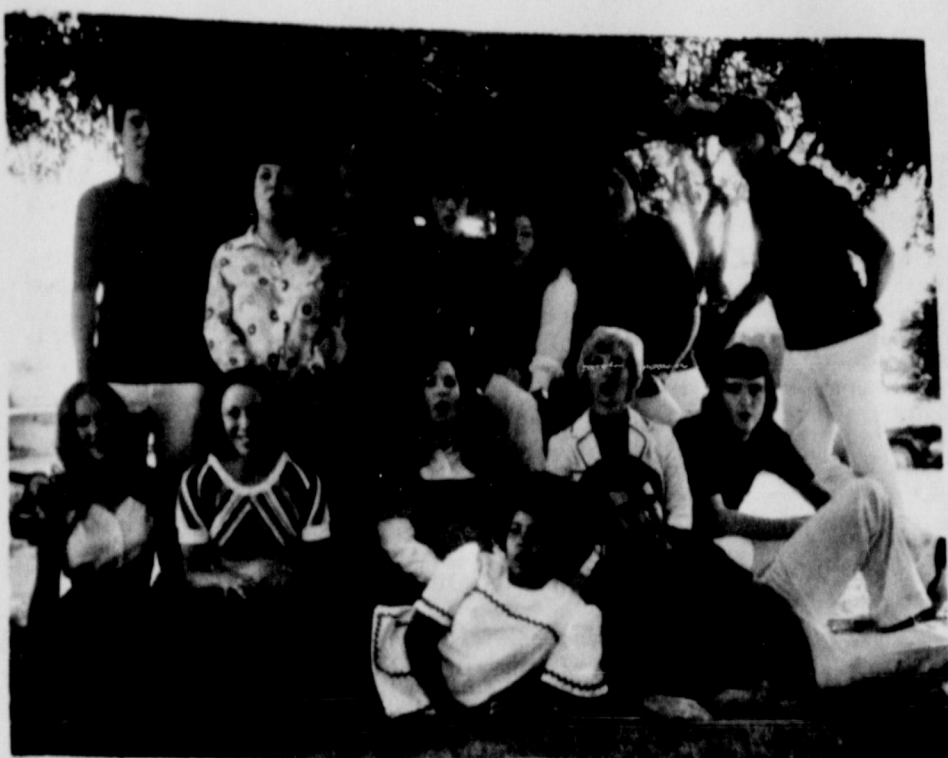
"MORNING STAR" SINGING GROUP from McMurry College