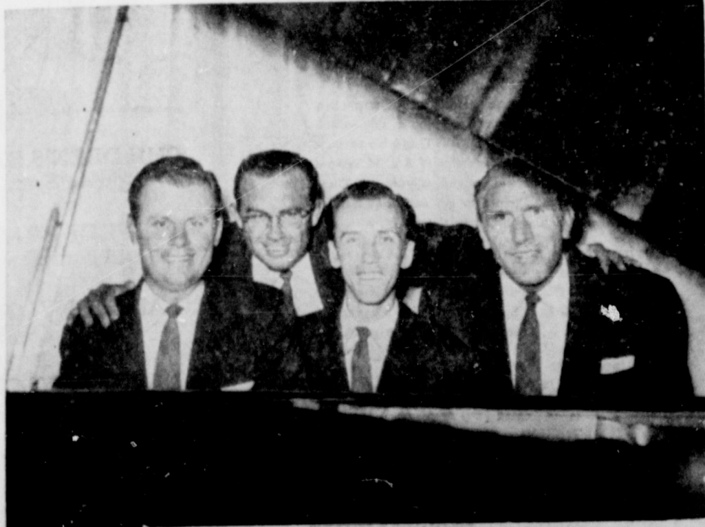
STAMPS OZARK QUARTET

The public was cordially invited to attend.