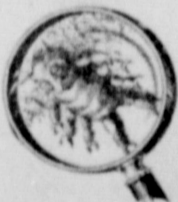
The common cold germ is responsible for more than two hundred million illnesses each year.