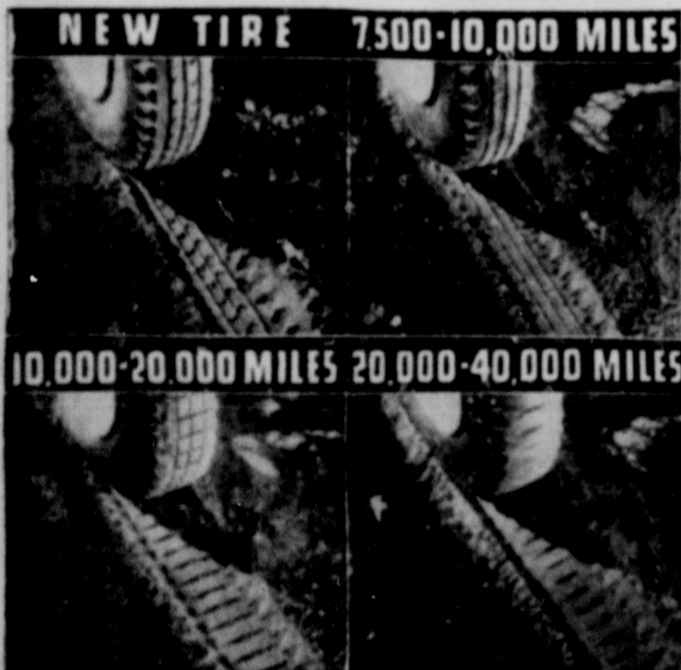
These four photographs show you how a two-tread Seiberling tire doubles safe mileage and never wears smooth. See us today—we make liberal trade-in allowances!