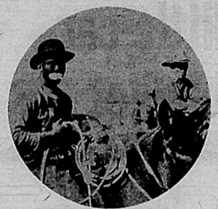
BAIRD, TEXAS - AUGUST 23 - 24 Sponsored by Callahan County Sheriff's Posse