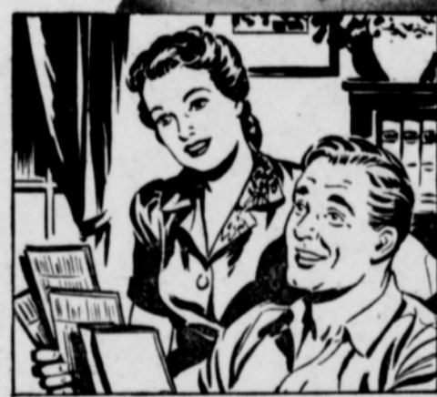
"For if farm income should drop, we could still pay for the improvements. Victory Bonds yield a fine return . . . and are just like cash in case of need!"