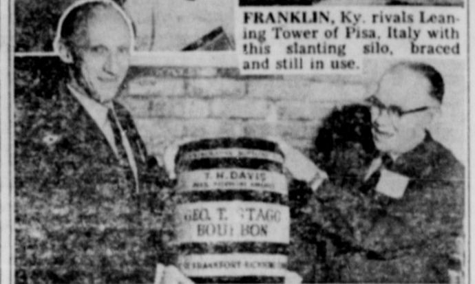
FRANKLIN, Ky. rivals Leaning Tower of Pisa, Italy with this slanting silo, braced and still in use.