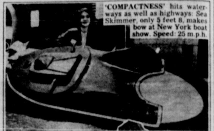
'COMPACTNESS' hits waterways as well as highways: Sea Skimmer, only 5 feet 8, makes bow at New York boat show. Speed: 25 m.p.h.