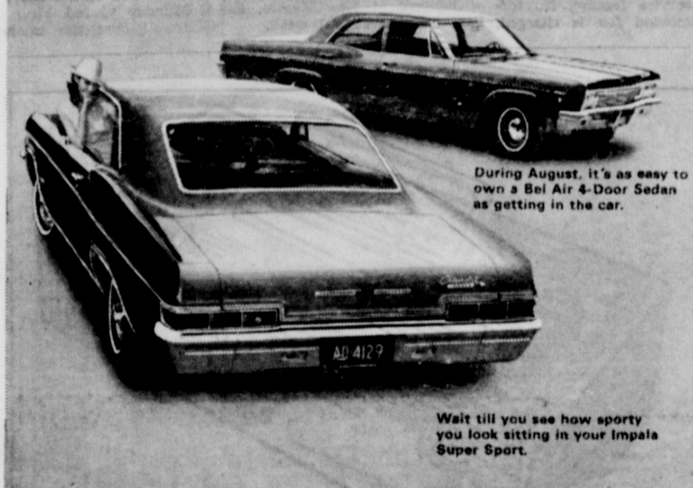
During August, it's as easy to own a Bel Air 4-Door Sedan as getting in the car.

Are there really any sound reasons for buying a Chevrolet in August?