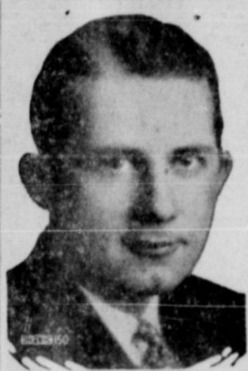
ALLAN SHIVERS of Jefferson County

Senator Allan Shivers is basing his appeal for promotion to lieutenant governor on service to his state and his country. Dean of the Texas Senate, he is rated one of the ablest and most active members of the legislature and, on his record alone, is entitled to be promoted to the rank of presiding officer of the Senate. He spent two years overseas as a soldier in World War II.