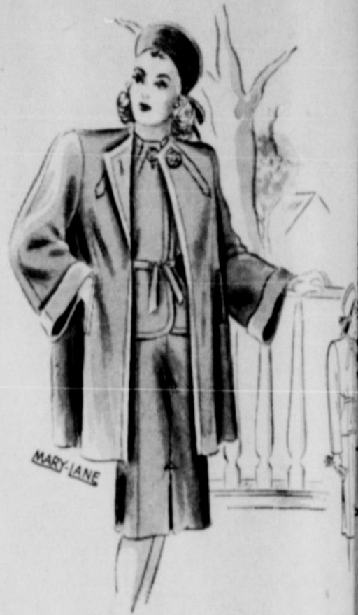
This lovely coat pictured here can be had in Tan, Brown and Black.