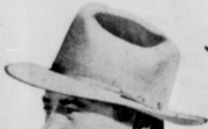
Dennis Morgan Starring in Warner Bros. Picture "TWO GUYS FROM MILWAUKEE"

DENNIS MORGAN WEARS A RESISTOL "SAN ANTONIO"